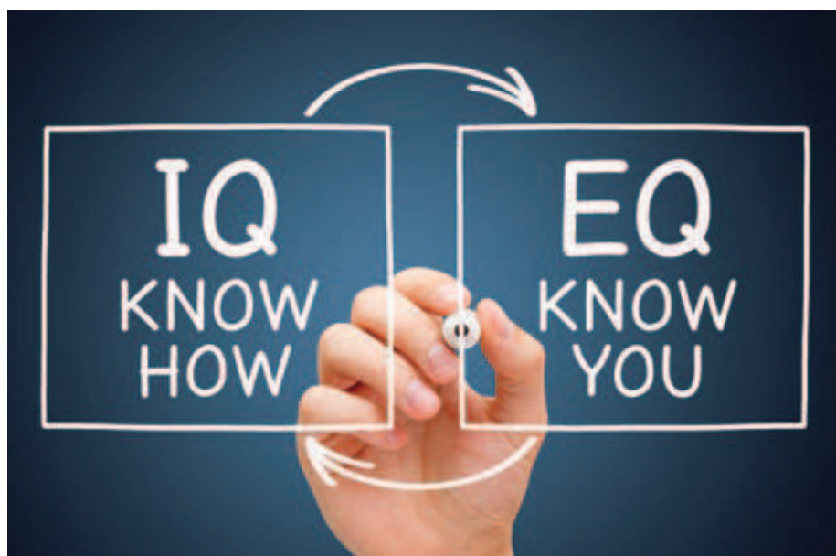
Figure 2: Whilst the value of a potential partner's technical “know-how” is very well established in the pharma industry, it is also important to find a partner with the emotional intelligence to understand and gel with a pharma company's culture and values, to have the “know-you” factor.

Today, with the manufacture and sale of CFC-based products now banned entirely, attention has turned to the carbon impact of the broader collective group of fluorinated gases (F-gases), which includes HFAs. This presents the industry with the next challenge in its carbon-reduction journey.